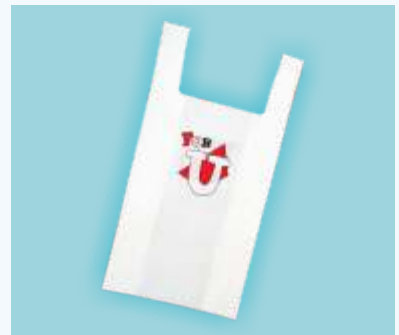
Reduces TiO 2 Master Batch