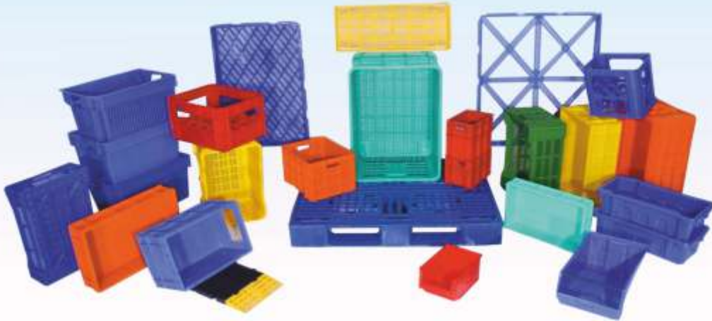
HDPE Injection Molded Crates & Pallet