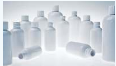
Injection Blow Moulding Product