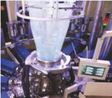
Multi Layer Blown Film Application