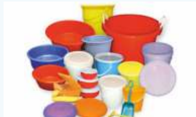
Injection Moulding Plastic Product