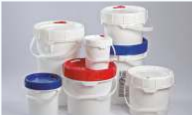
HDPE Injection Moulded Pails