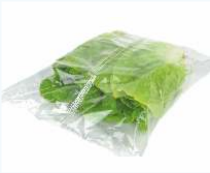
Vegetable Film Packaging