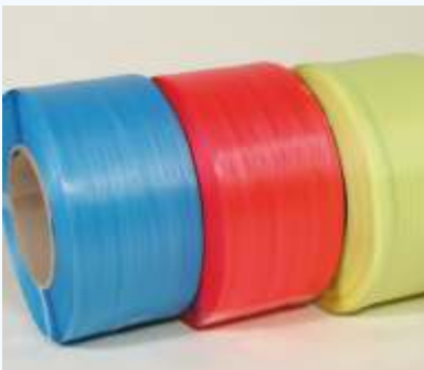
Blown Flim Rolls