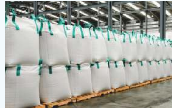
FIBC/ JUMBO BAG