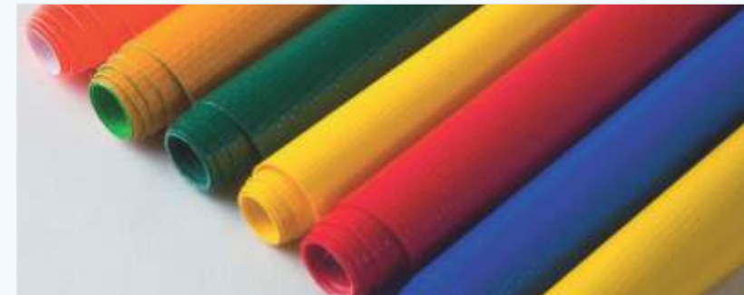
LAMINATED TARPAULIN FABRIC