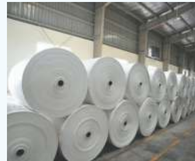
LOW DEBEIR PP FABRIC ROLLS