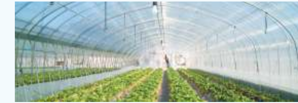
WOVEN GREEN HOUSE FABRIC